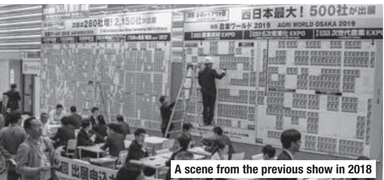
A scene from the previous show in 2018